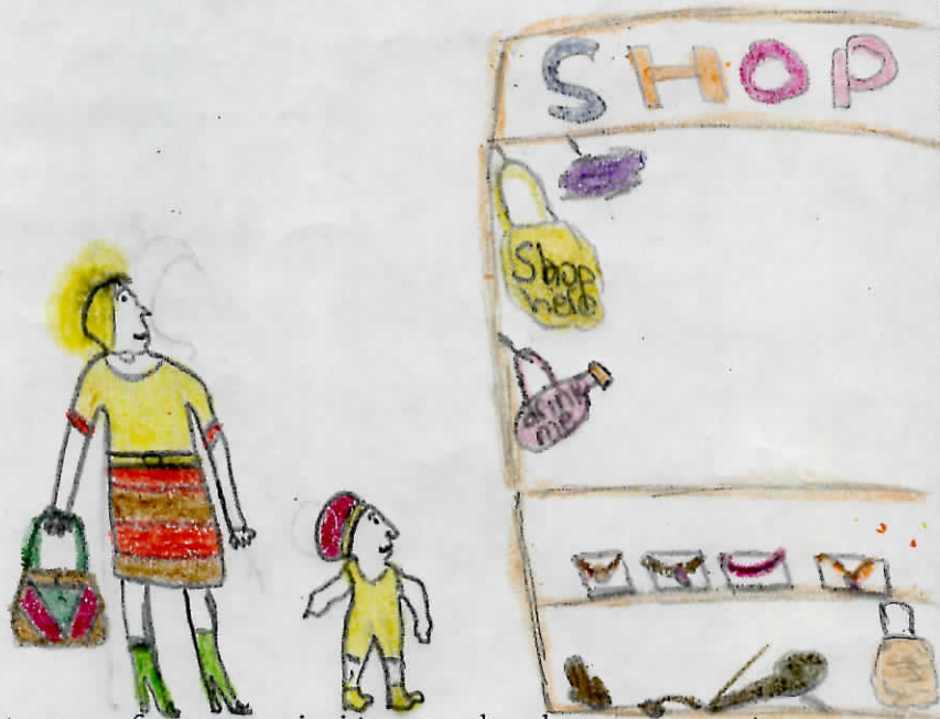
Draw a picture of some visitors who have come to Jamaica from far away.

Shoppers like to buy present from jamaican shops.